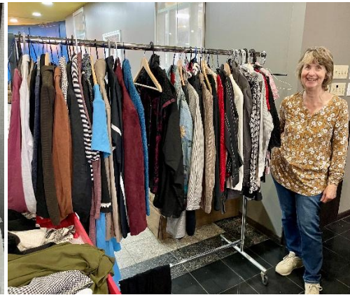
Knights Inn Mixer