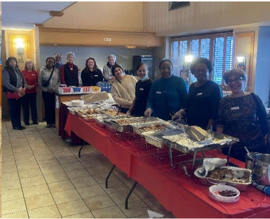
Christmas Dinner Mixer