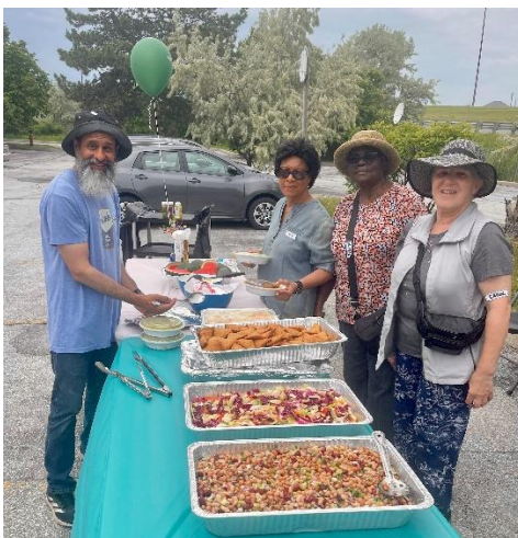
Holida Inn Barbeque