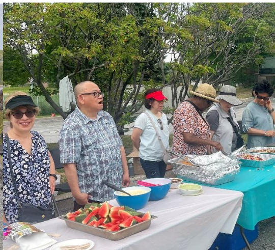
Holiday Inn Barbeque