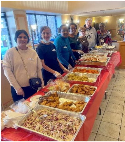
Christmas Dinner Mixer