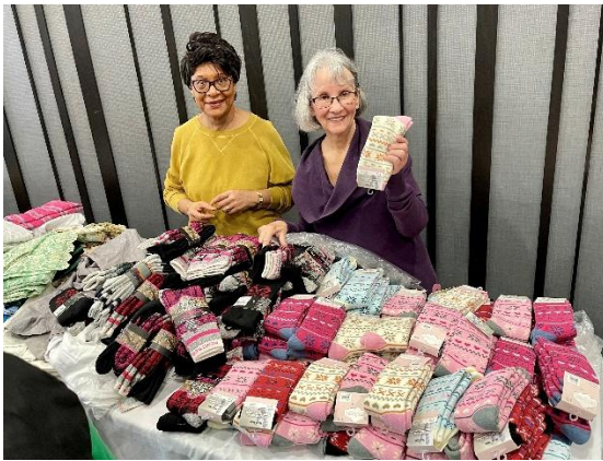
Knights Inn Mixer